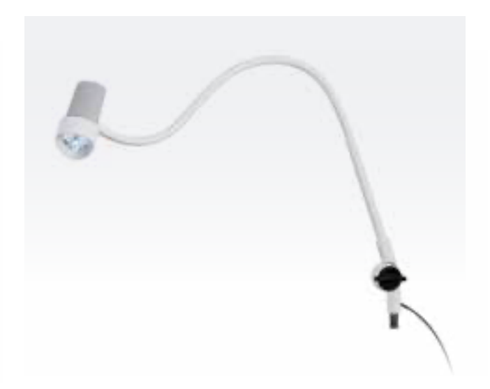
HALUX N30 P SH and SV