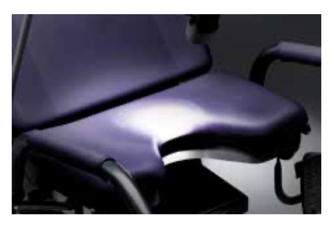
Optimal vision thanks to homogeneous, spot-like illumination field